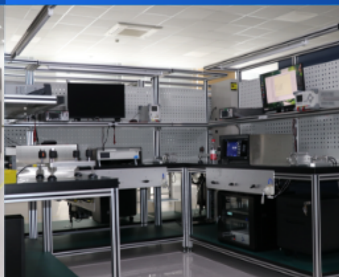
Product Test Area